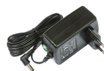
24 V 1.2 A power adapter included

IPsec hardware encryption (~470 Mbps) and The Dude server package is supported, microSD slot on it provides improved r/w speed for file storage and Dude.