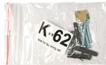
Fastening set (K62)