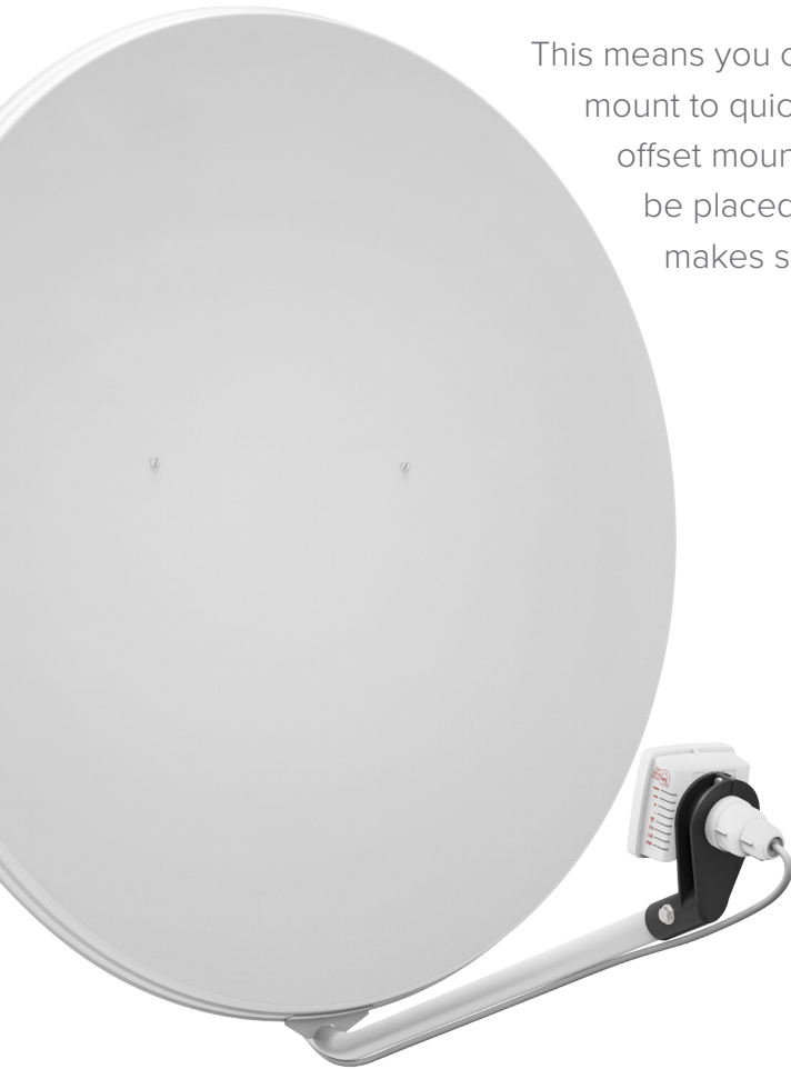
Dish is not included.

This means you can use any available satellite TV dish with an offset mount to quickly deploy powerful long range wireless links. The offset mount is universal at 40mm diameter, and the LDF can easily be placed inside it. Since the LDF itself is a tiny little package, it makes shipping and deployment simple and low cost.