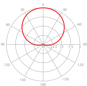
V/H - Port Pattern Elevation 5.6 GHz